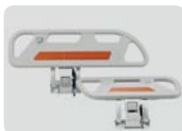
Automatic Long and Short lifting railing Frame: PE molding, safe and reliable, and can be fixed upward and downward Degree show function