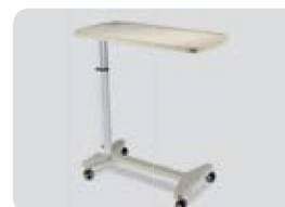
Accessories (option) Bedside table Movable, can adjust the position low or high Made of ABS and aluminum alloy