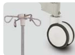
Two Sections I.V. Pole (Four Hooks) Frame: Stainless steel Twin-wheel Lockable Castors Central Brake System