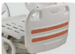
Bed head and foot board Frame: PE Molding Movable head and foot boards with Lock-Switch, the board can be detached easily and quickly.