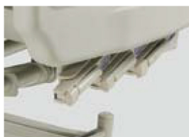
Triple manual crank system The crank adopt Hidden design