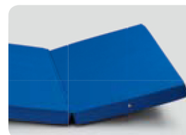
Accessories (option) Mattress Inside: high dense sponge, coco & palm fibre Surface: waterproof & wearable cloth (fireproof as optional)