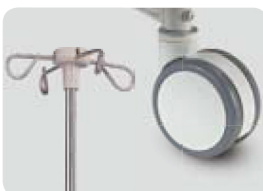
Two Sections I.V. Pole (Four Hooks) Frame: Stainless steel

5" universal castors(2pcs with brake, 2pcs without brake)