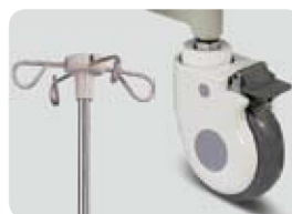
Two Sections I.V. Pole (Four Hooks) Frame: Stainless steel

5" universal castors (2pcs with brake, 2pcs without brake)