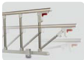
Collapsible side rail 6 aluminum bars fence with Lock-Switch can be collapsed easily and quickly

Mattress Inside: high dense sponge, coco & palm fibre Surface: waterproof & wearable cloth (fireproof as optional)