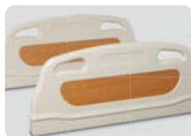
Bed head and foot board Frame: ABS Molding Movable head and foot boards with Lock-Switch, the board can be detached easily and quickly.

5" universal castors (2pcs with brake, 2pcs without brake)