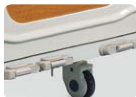
Triple manual crank system