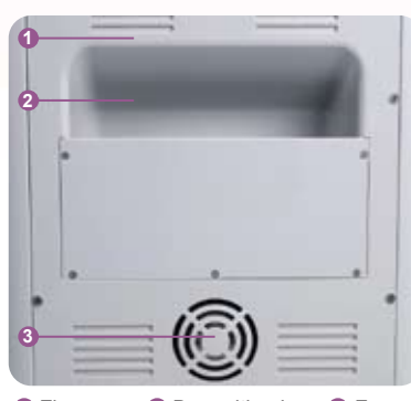
1 Fix cover 2 Depositing box 3 Fan