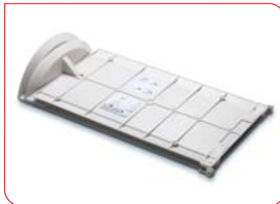
The high-quality folding mechanism guarantees a long service life.