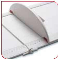
The measurement results are easy to read from the large scale.

The lightness of the measuring board is matched by the high quality of the folding mechanism, head piece and foot positioner. Special attention is paid to the choice of materials which can stand up to years of tough use without losing their shape. Additional protection is provided by the seca 412 carrier bag made of water-repellent lightweight nylon.